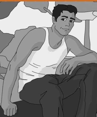
Character artwork from CRUFAD self-help module for gay men with depression ( www.climategp.tv )

In addition, the key study findings will be used to inform the development or revision of case studies and other materials used in Australasian Society for HIV Medicine (ASHM) education and training programs for s100 GP prescribers, to ensure that GPs are aware of these most recent data on the identification and management of depression and associated psychological issues amongst gay men, including people living with HIV, in Australia.